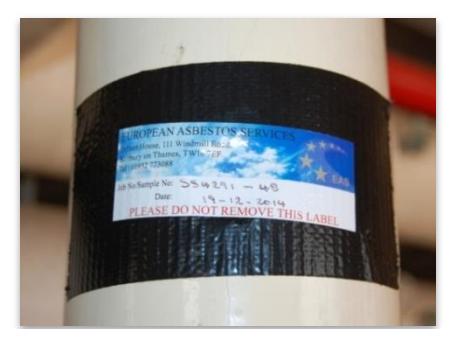
Asbestos marked pipe

15. Proper decontamination needs to be done for a number of reasons other than reuse or recycling: to protect the environment; to protect the health of workers; to protect the health of people living in the surroundings of the site, and for safety reasons. Typical hazardous waste products from construction, renovation or demolition works are asbestos, tar, radioactive waste, PCBs, lead, electrical components containing mercury<sup>15</sup>, insulation materials containing hazardous substances etc.