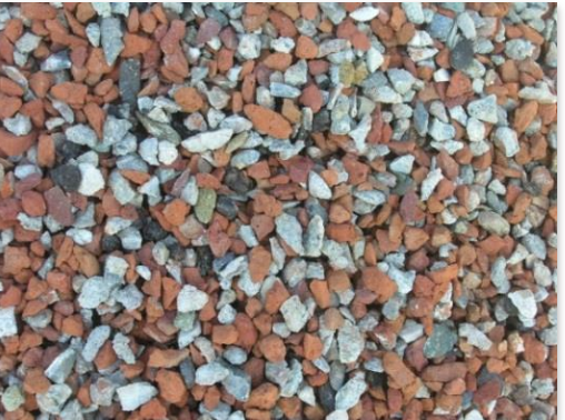
Recycled granular aggregate, Source: ANPAR