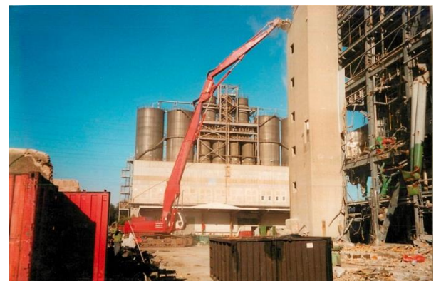
Demolition site.

performed, which materials will be collected selectively at source, where and how they will be transported, what will be the recycling, re-use or final treatment and how to follow up. Such a plan also covers how to address safety and security issues, as well as how to limit environmental impacts, including leaching and dust. In the plan it should be stated how both the non-hazardous and hazardous waste will be managed.