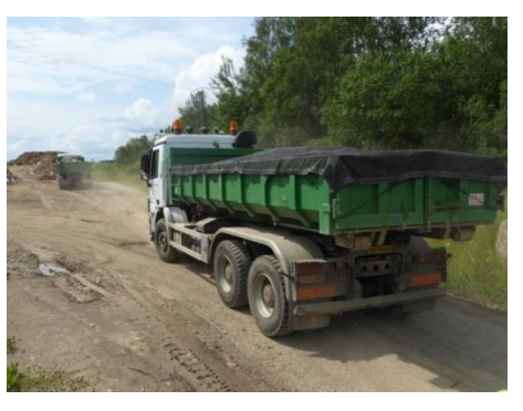
Truck transporting C&D waste, Source: A2Conseils sprl

5. Try to keep distances short. Proximity of sorting and recycling plants is very important for C&D waste, which in case of bulky materials such as aggregates for construction (asphalt, concrete, etc.) cannot be transported by road over longer distances (usually maximum 35 km). Unless transported in large volumes by rail or waterway, longer distances are simply not economically attractive<sup>23</sup>, while environmental benefits of recycling diminish over longer distances as well.