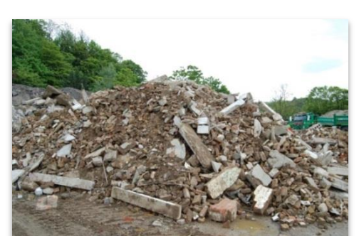
Construction and demolition waste